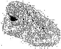
31.48 Chasse Ace II Cheer shoe item #S1701