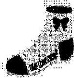
4.95 IS162 royal