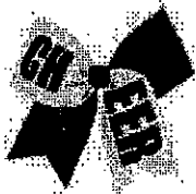
5.78 ac355 royal

Cheerleaders are responsible for the purchase of their shoes, hair bow and socks. Uniforms will be provided by the school. Items are located on omnicheer.com website