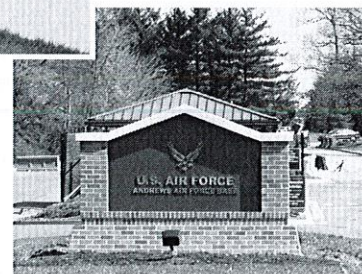
Joint Base Andrews