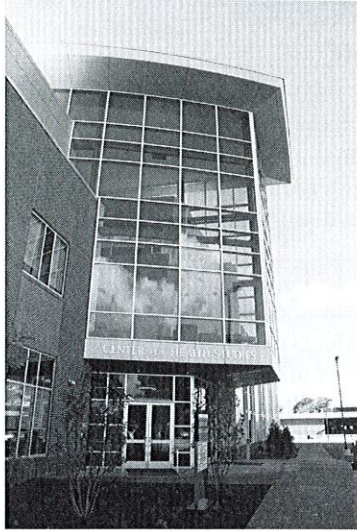
Center for Health Studies Largo Campus