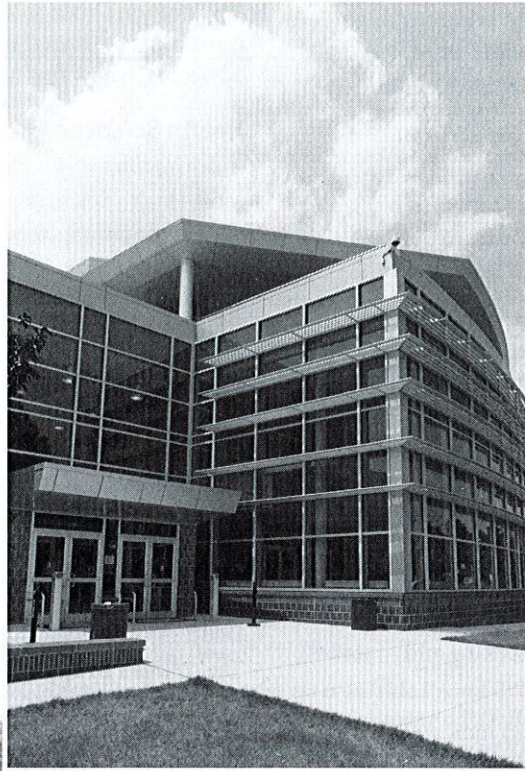
Center for Advanced Technology Largo Campus