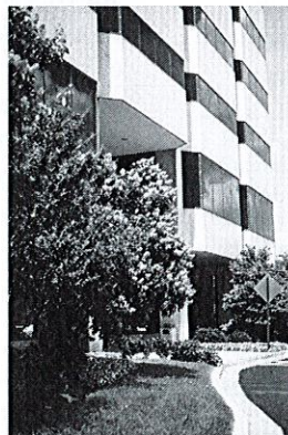
Laurel College Center